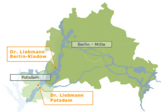
Location in Berlin/ Potsdam

You can reach us via the following bus routes