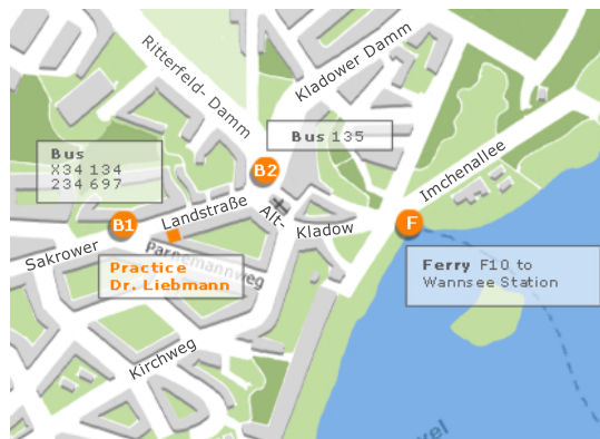
Location of practice in Berlin-Kladow